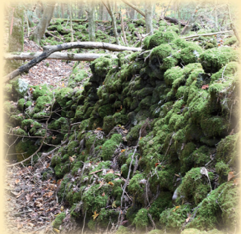
The stone wall Fence said to have been built by the Takeda Clan