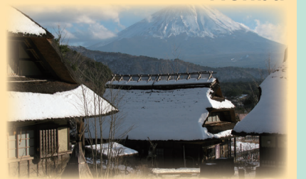
quintessential scenery of Japan