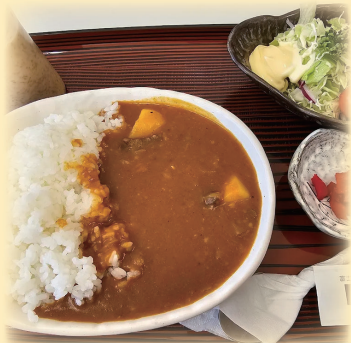
The New Specialty : Venison Curry