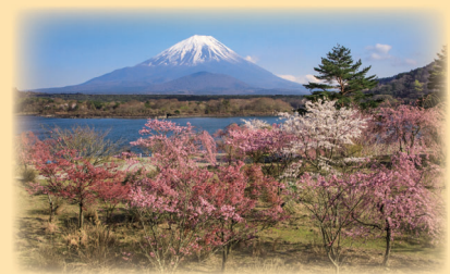
Mt. Fuji (the Parent) Mt. Omuro (the Child)